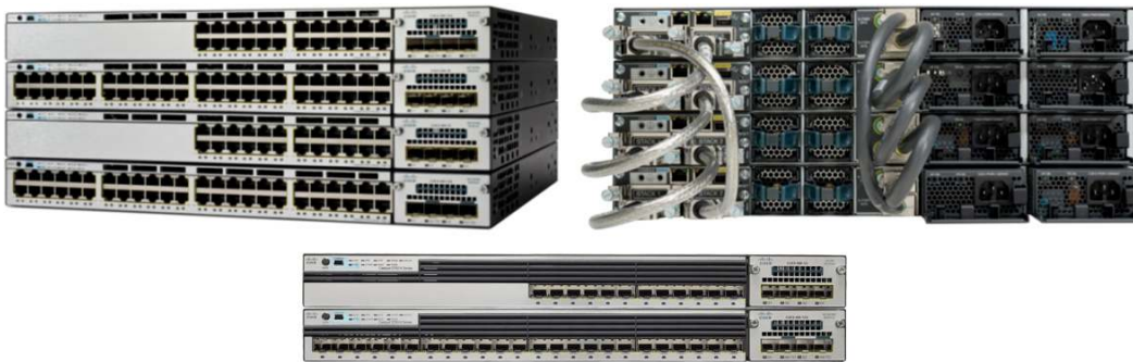
Figure 1. Cisco Catalyst 3750-X Series Switches (Front and Back)

Table 1 shows the Cisco Catalyst 3750-X Series configurations.