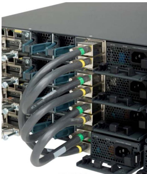
Figure 3. StackPower Connector

The Cisco Catalyst 3750-X Series introduces Cisco StackPower technology, innovative power interconnect system that allows the power supplies in a stack to be shared as a common resource among all the switches. Cisco StackPower unifies the individual power supplies installed in the switches and creates a pool of power, directing that power where it is needed. This feature is available in all Cisco Catalyst 3750-X Series Switches feature sets. Up to four switches can be configured in a StackPower stack with the special connector at the back of the switch using the StackPower cable**, which is different than the StackWise cables. (See Figure 3.)