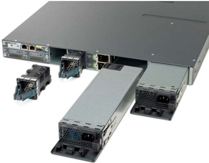
Figure 5. Dual Redundant Power Supplies

Table 6 shows the different power supplies available in these switches and available PoE power.