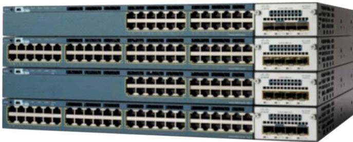
Figure 2. Cisco Catalyst 3560-X Series Switches

Table 2 shows the Cisco Catalyst 3560-X Series configurations.